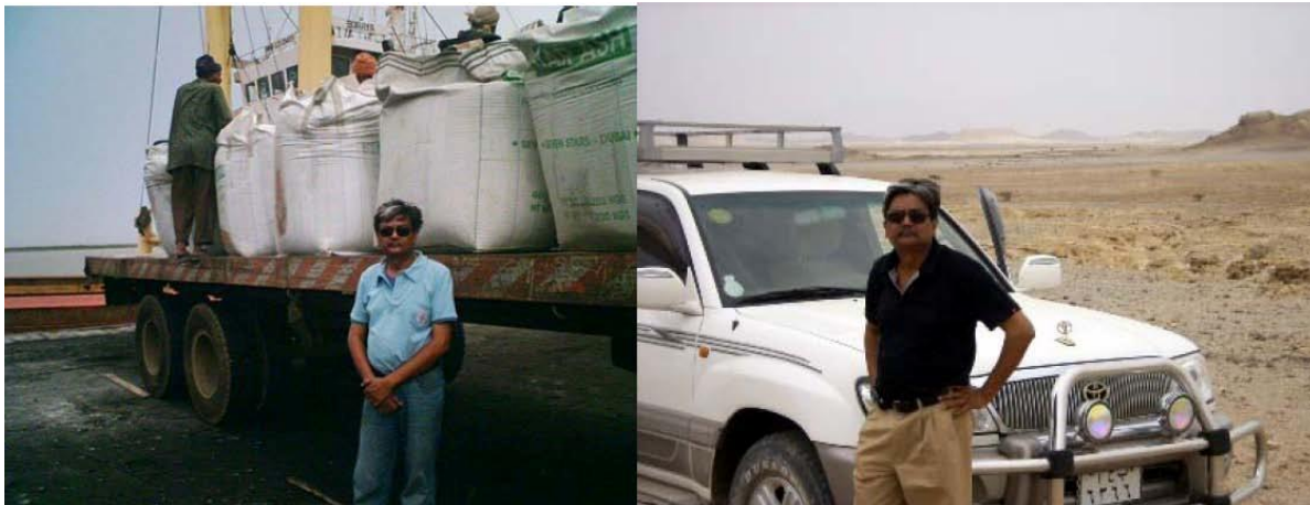
Above: Exporting FLY ASH from Kandla (2007) and exploring Gypsum mines for El-Sharq Cement factory (2006). Below: With CHUBU ELECTRIC OFFICIALS (2011) for advise on Fly Ash Generated at their 4100 MW power plant