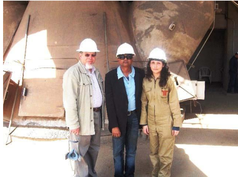
At 2*300 tpd Cementos Tequendama, Bogota 2008)